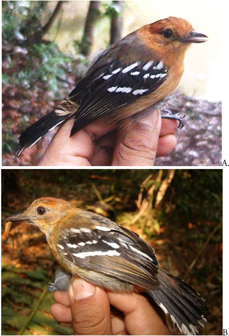
Figure 2. Females of the Large-billed Antwren ( Herpsilochmus longirostris ) captured in A. Pando Department and B. La Paz Department.

Using the GARP program, a potential distribution map of H. longirostris was generated for the Cerrado biome, where the species has a higher probability of occurrence in the western areas, spreading into the state of Rondônia and north-northeast Bolivia (Leite 2006). The Cerrado includes the central Brazil, with small extensions into northeastern Paraguay and eastern Bolivia (Silva 1996, Silva & Bates 2002), where 759 species of birds (30 endemic) occur. Of those, only 14% of them, including H. longirostris , have distributions of more than 1000 km 2 within this region (Silva & Bates 2002). Therefore, the presence of the species in the Pando Department was to be expected, although in an ornithological survey conducted in the RVS Bruno Racua (Stotz et al. 2003) the species was not recorded, even in areas adjacent to the eastern part of the reserve and on the Madera River, in the